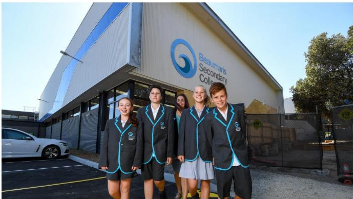
Beaumaris Secondary College school leaders.

The fastest growing schools across southeast Melbourne have been announced, exposing where student numbers have rapidly increased and where they've bottomed out.